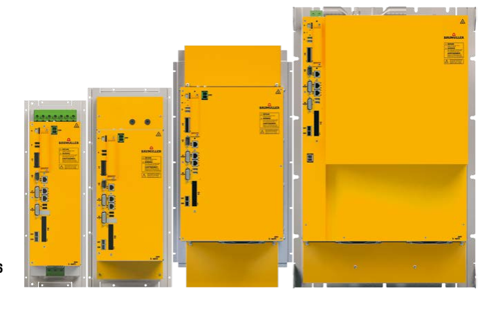
b maXX 6500 frame sizes 3, 4, 5 and 6

The mono units b maXX 6500 are available in 4 different sizes. The devices cover a power range from 1 to 315 kW and soon even up to 400 kW. Thanks to the high compactness the b maXX 6500 units enable smaller control cabinets.